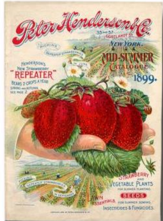
Peter Henderson & Co. Mid-Summer Catalog, 1899. New Jersey Trade Catalogs Collection, Special Collections and University Archives, Rutgers University Libraries.